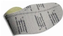
Flexible protective insole